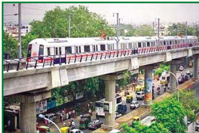
Metro : Initiative for decongesting road & enhancing faster & safer travel