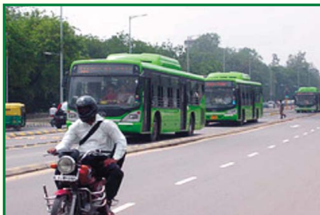
Introduction of low floor high capacity buses with mechanised doors in the public transport system to enhance comfort and safety